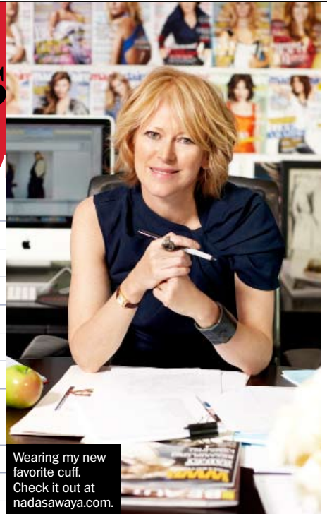
Wearing my new favorite cuff. Check it out at nadasaway.com .